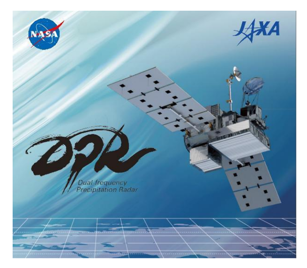
Figure 3: The Dual-Frequency Precipitation Radar (DPR) is the two boxes on the bottom of the Core Observatory – the small one is the Ka frequency radar and the larger flat box is the Ku frequency radar

Other components of the satellite include the solar panels to provide power, a high gain data-relay antenna for communication, a star-field finder for navigation, and a control system to manage the satellite.