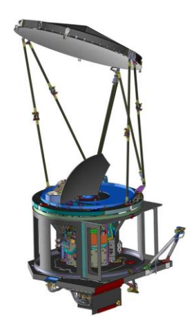
Figure 4: GPM Microwave Imager (GMI) is a passive radiometer with an antenna above.

The GPM mission is co-led by NASA and the Japan Aerospace Exploration Agency (JAXA). The GPM Core Observatory is scheduled for launch in early 2014.