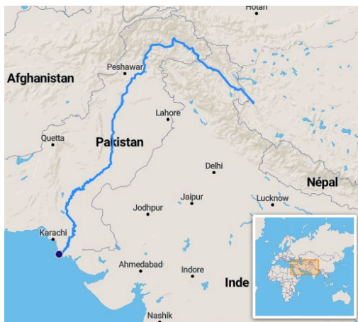
Figure 2: By Openstreetmap contributors

Today, Pakistan does not have enough freshwater resources to meet the needs of all the people who live there. It is known as a “water scarce” country, and freshwater availability is less than 0.001 liter/0.00026 gallon per person per day. There are many reasons for this freshwater scarcity. One of the reasons is that water management has not been a big focus of the government until recently. Agriculture is the biggest water user in Pakistan, and about 90% of the crops use irrigation, rather than relying on rainfall, to water their crops.