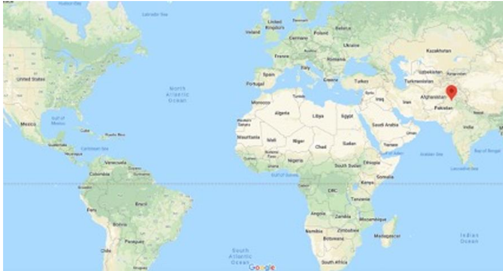
Figure 1: Developed using Google Maps

In Pakistan, agriculture is the largest sector of the economy, and all of Pakistan's people depend on farmers for their food. The main crops that are produced are wheat, sugarcane, rice, and maize. Of all the crops grown here, however, wheat is the biggest agricultural crop by far. The Sargodha region is known for being a major grain producer, and the main crop grown in this region is wheat. The season for growing wheat begins in February and runs through the beginning of August. As there is not always enough precipitation to water wheat crops throughout the growing season, wheat farmers will irrigate their wheat crops by flooding their fields with water.